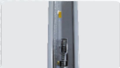
Dual safety device and electro-magnet safety release.