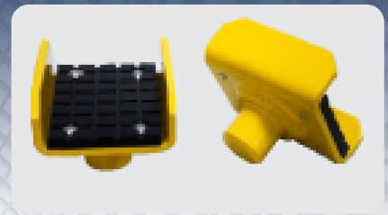
Optional saddle adapter. Kits No.: 20802(light truck)