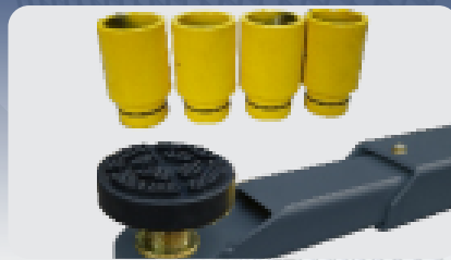
Both insert and screw rubber pads with 3" extension adapters