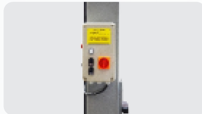
24V voltage control device, more safety and convenient