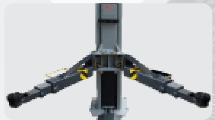
4 three-stage arms giving more flexibility to your lifting points