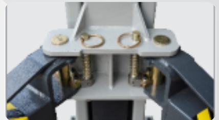
Automatic arms restraints and release.