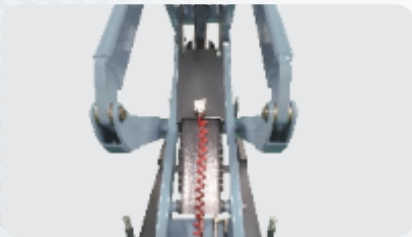
Automatic safety air release