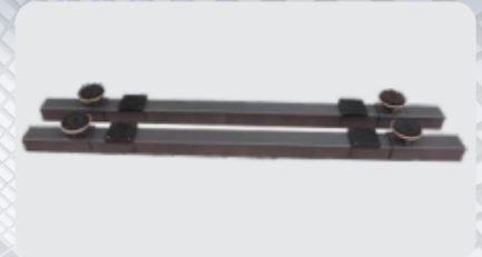
Leveling bar Kits No.: T300XS