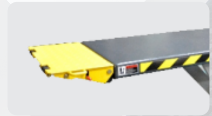
Movable drive-in ramps, and extendable platform.