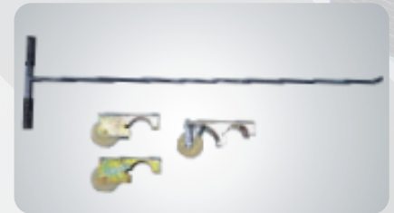
Standard with portable kits include mobile bracket wheel and pulling bar