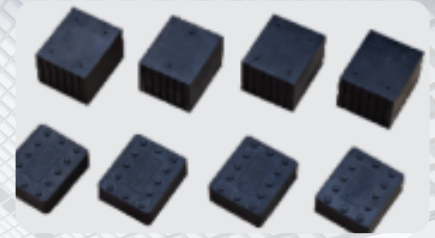
Both 38mm and 75mm height rubber pads included as standard supply.