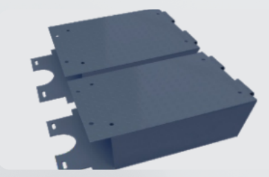
Optional plataform extension kits adds an extra 610mm lenght to the plataform. Kits No.:40903